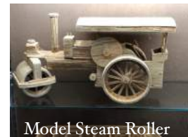
Model Steam Roller made from Matchsticks