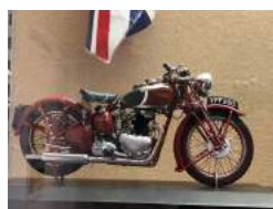
Model of Triumph T80

Featured is Donegani's garage of East Road, Arthur Howitt's saddlery in New Street, the introduction of the bypass, the construction of the North Bridge, stage coaches, trains and