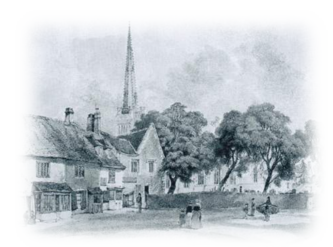
North Street in about 1850

As well as the permanent gallery a new themed exhibition is presented each year so there is always something new to see. Every year the museum has holiday activities and special events. Check our website and Facebook page.